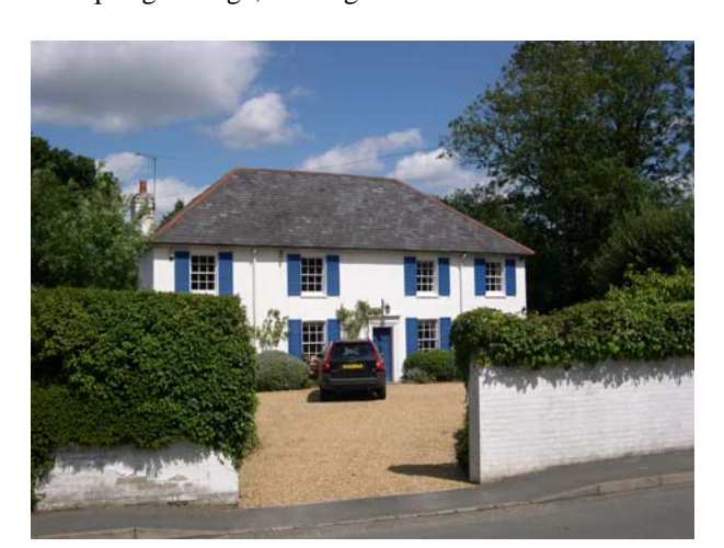
33 The Old Fox, looking north-east