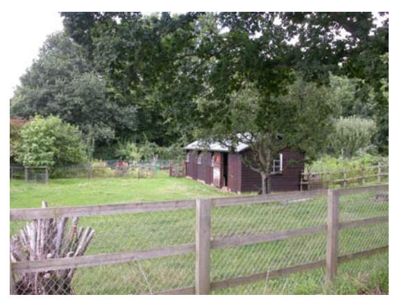
11 Modern stables of Grove Farm, looking north-east