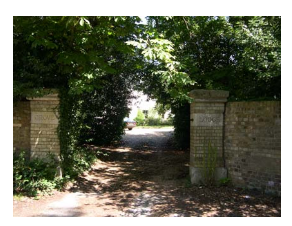
16 Entrance to Grove Lodge, looking north-east