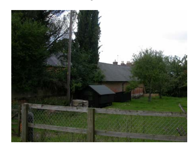
10 Cow sheds east of Grove Farm, looking south-west