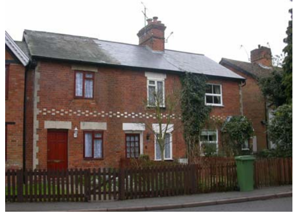
26 North terrace block, looking east