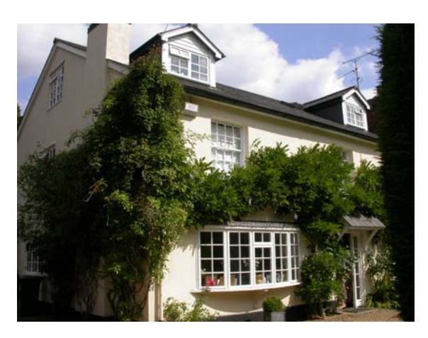
22 Baytree Cottage, looking north-east