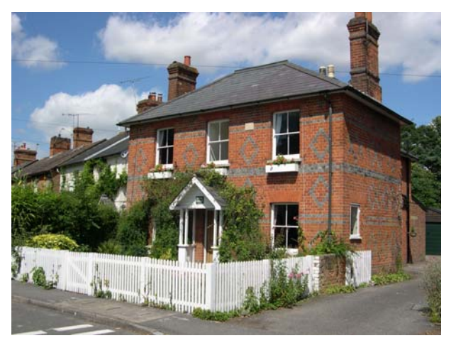
31 Spring Cottage, looking north