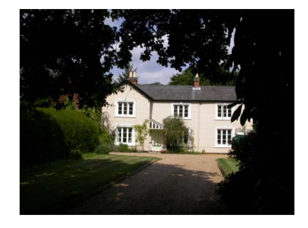
6 Apple Tree Cottage, looking north-east