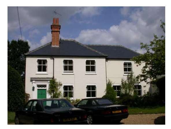
13 Victoria Cottage, looking north-east