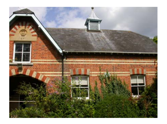
7 Grove Farm, looking north-east