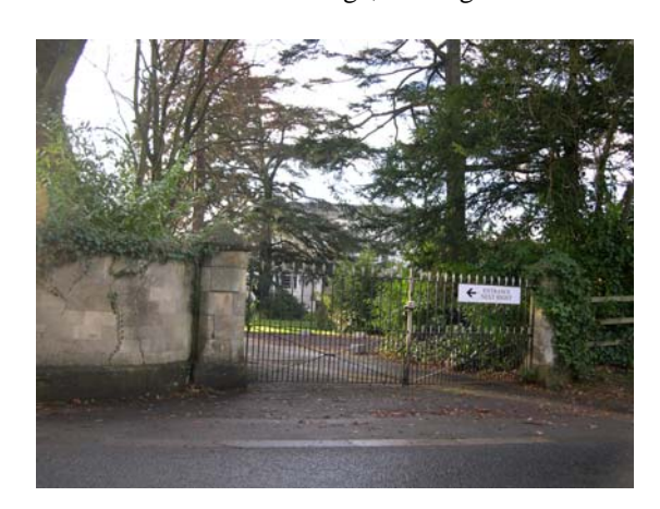
18 Entrance to Lambrook School, looking west