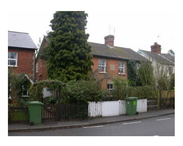
27 Central terrace block, looking east