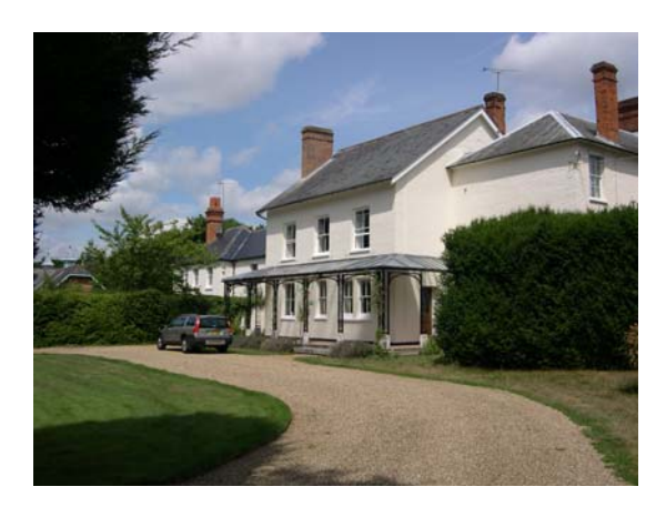
15 Grove Lodge, looking north-east