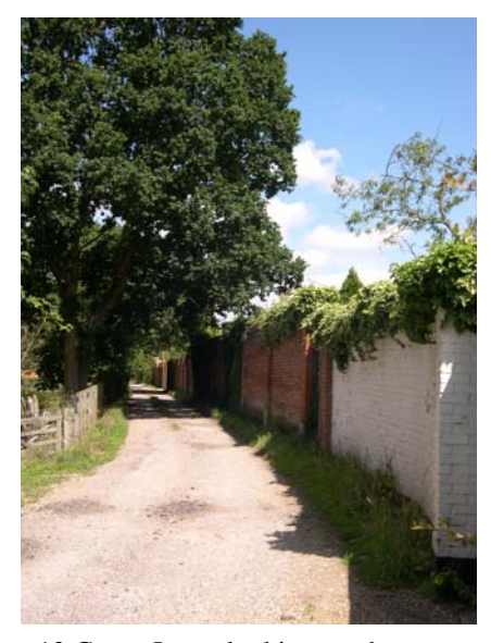
12 Grove Lane, looking north-east