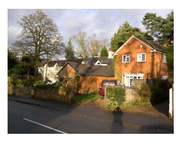
21 Sundial Cottage, looking north-east