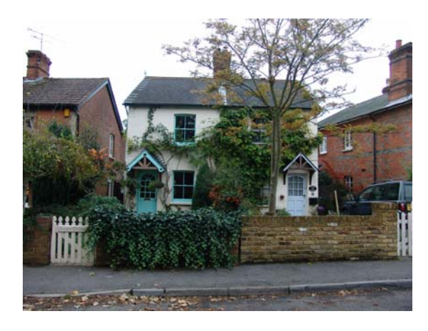
29 White terraces, looking east