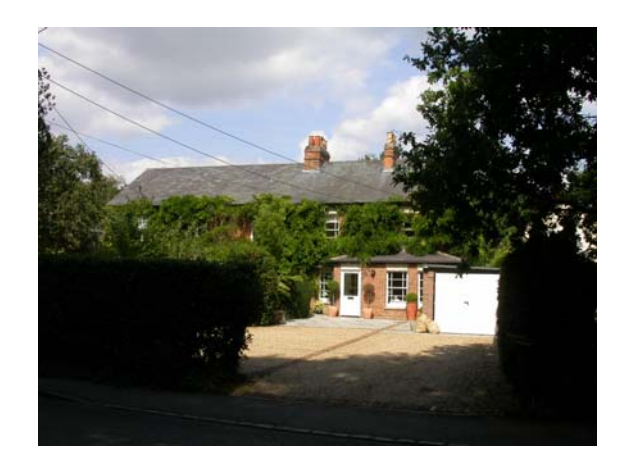
5 Wisteria Cottages, looking north-east