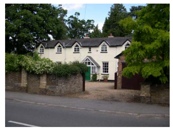
20 Little Britt, looking north-east