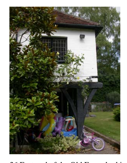
36 East end of the Old Farm, looking north-east