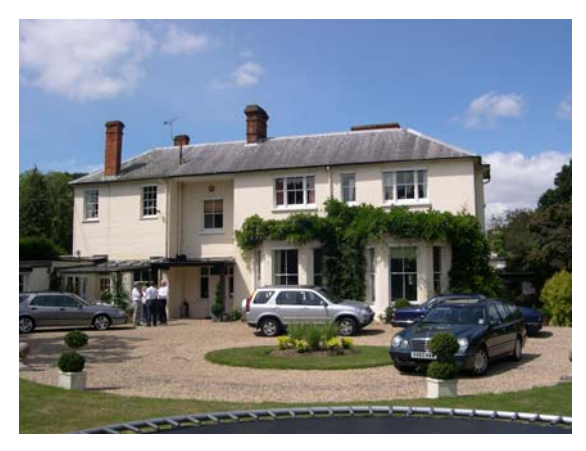
17 Birley House, looking north-west