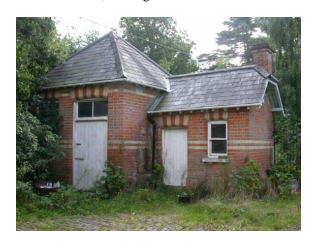
9 Foaling House, looking south-west