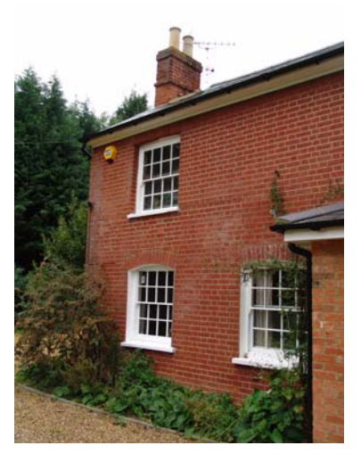
2 Milberton, looking north-east