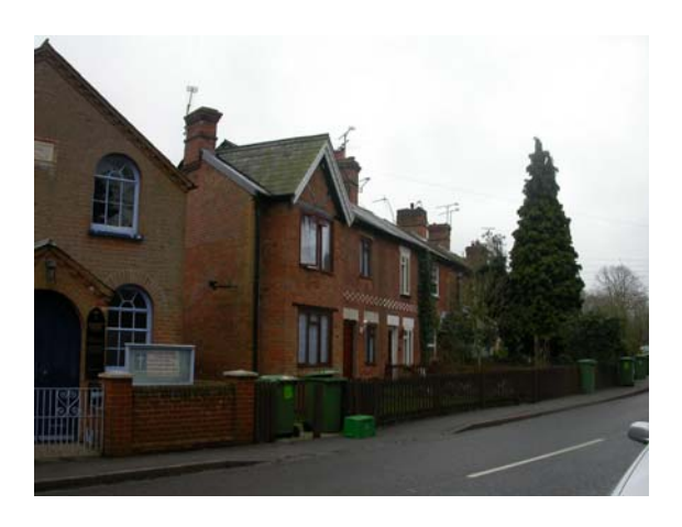
25 North terrace block, looking south-east