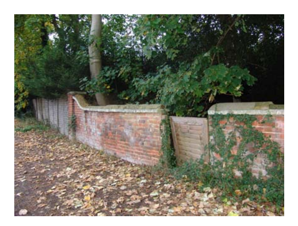
19 South boundary wall, Lambrook School, looking south-west