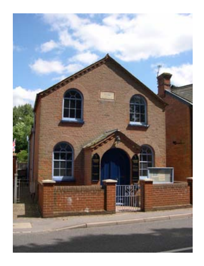
24 Methodist Chapel, looking east