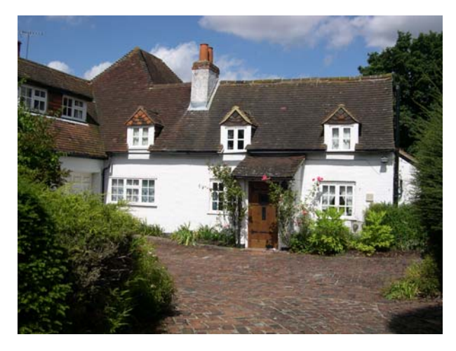
32 White Cottage, looking north