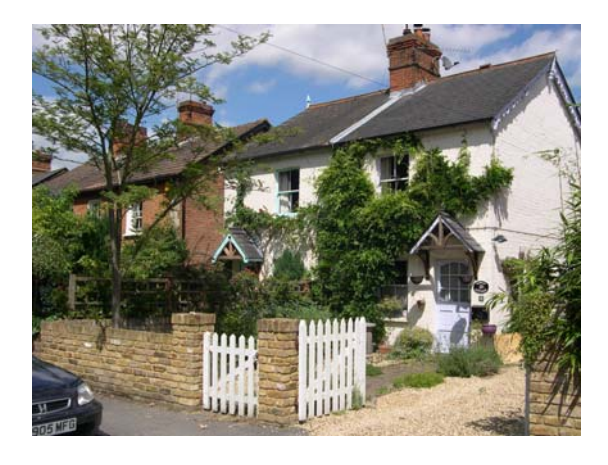
30 White terraces, looking north-east