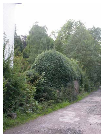
14 Lean-to shed in wall, Victoria Cottage, looking south-west