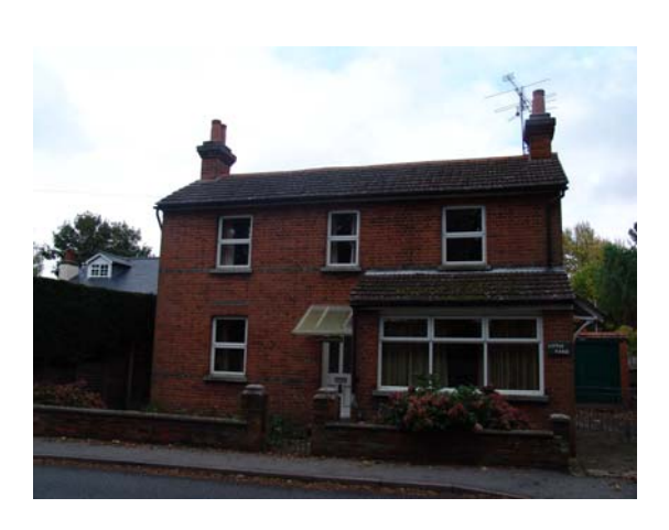
23 Little Gable, looking east