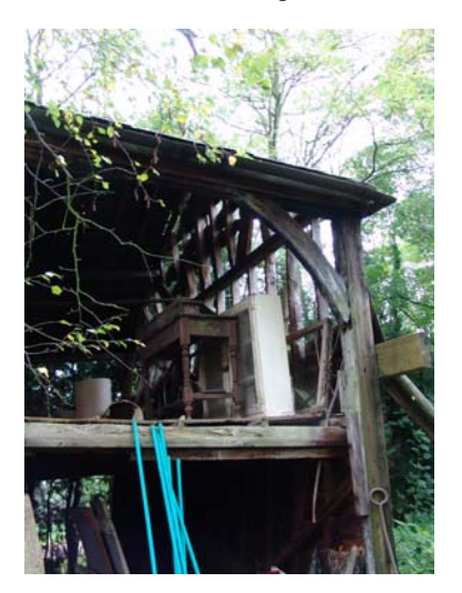
4 Barn in garden, looking north