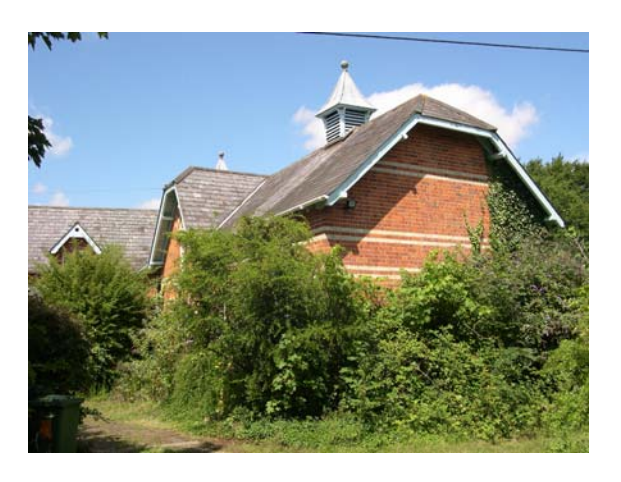
8 Grove Farm, looking north