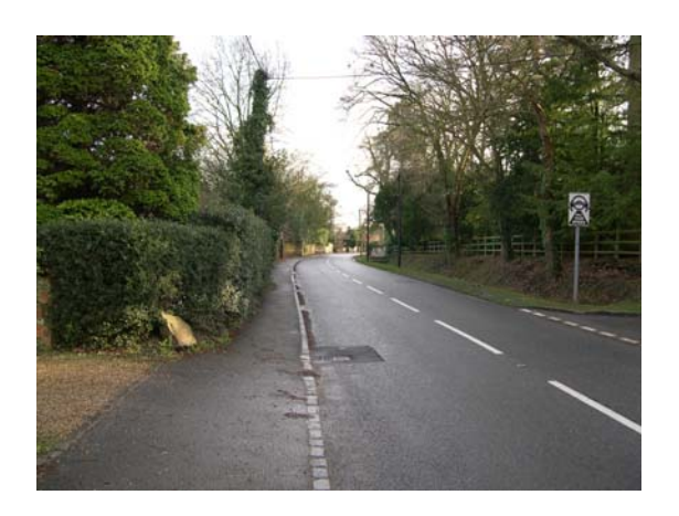
1 North approach to village, looking south