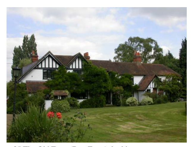
35 The Old Farm (Box Farm), looking north-east