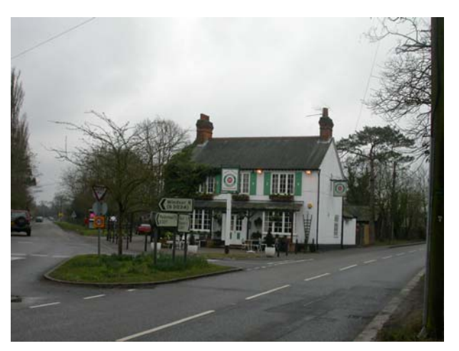
34 Restaurant (former White Horse public house), looking south