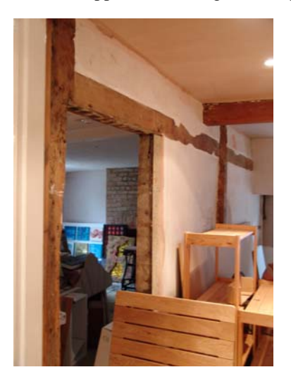
3 Exterior wall of front range, now internal